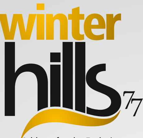
Address for the Exclusive

Experience a sense of peace that touches your soul, with a heavenly abode cradled in the lap of nature, only at Winter Hills, Sector-77, Curgaon.